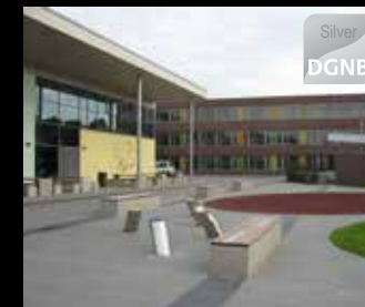
Island School, Fehmarn