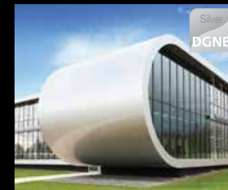
Project house „MeTeOr“, Technical University of Chemnitz