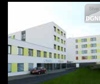
Physiotherapy Clinic, Großenhain